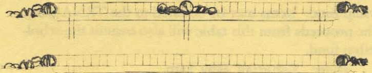
©RAFT, Not Released for Construction Courtesy of Twin Mountain Construction, PTC

The final design for the Atrisco bridge has been approved, and the artwork on the west bridge will be similar to that of the Atrisco bridge but more dense. A new version of the design will be reviewed at the next Advisory Committee meeting on May 12th.