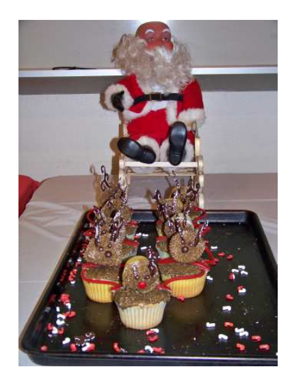
Images from the Holiday Luncheon December 8, 2012 12 noon – 2 pm Don Newton-Taylor Ranch Community Center