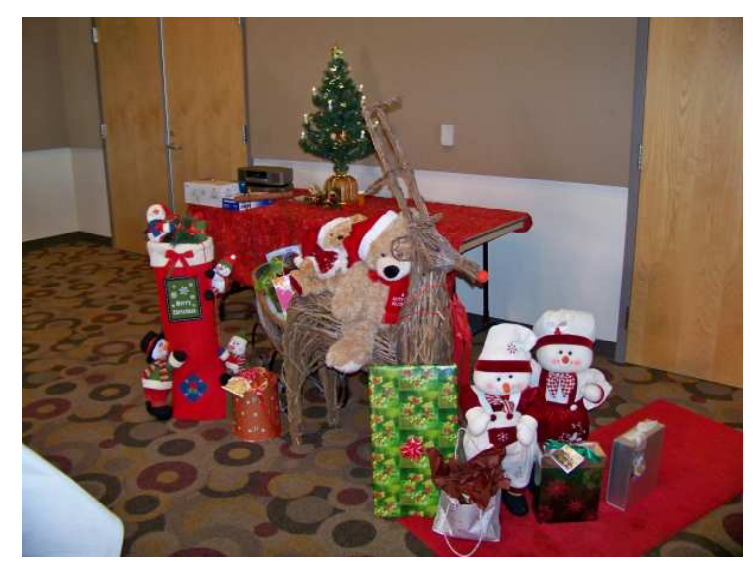
Nicely decorated display table at Holiday Luncheon

I wish all of our members happy holidays and a safe new year.