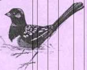
Towhees hop backward with a scratching motion to uncover food.

Nobody brings people and nature together like the Certified Birdfeeding specialists at Wild Birds Unlimited®, and our Unlimited Custom Seed Blend System™ proves it.